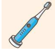
Rechargeable electric toothbrush