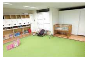
A child-rearing support center

From April 2025, a child-rearing support center and a short-time childcare room will be established.