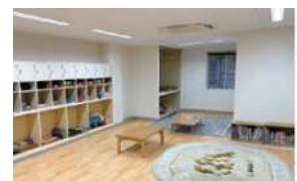
A short-time childcare room