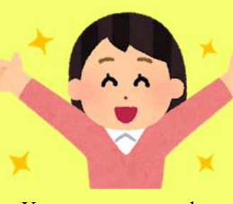
You are now a member of the neighborhood association!

If you don't know the name of the chairperson of the neighborhood association of the area you are moving to, please contact the Coexistence and Inclusive Society Division.