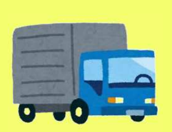
On moving to Toyoake City